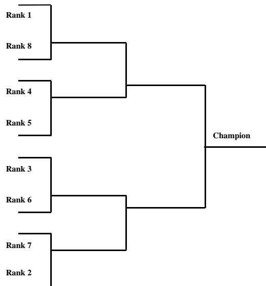
Fig. 2. Table of 8

The Table of 8 shown in Fig. 2 will be used. The pairing or opponents will go according to the ranking during the Preliminary Matches. Figure 2 shows the competition matches in a Table of 8.